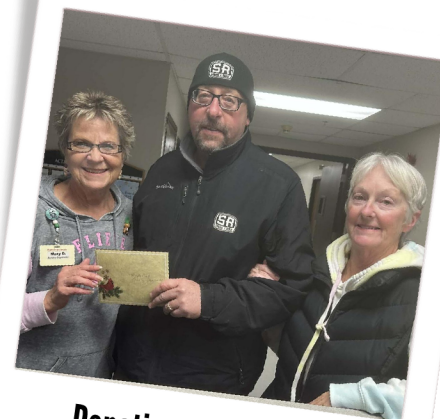
Donations to Activities