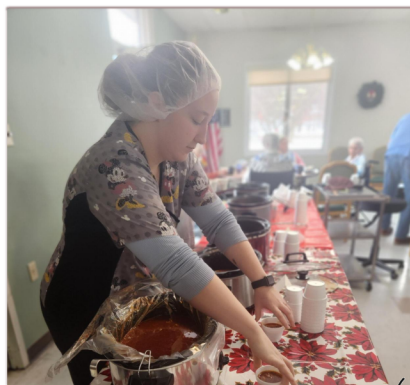
Chili Cook Off