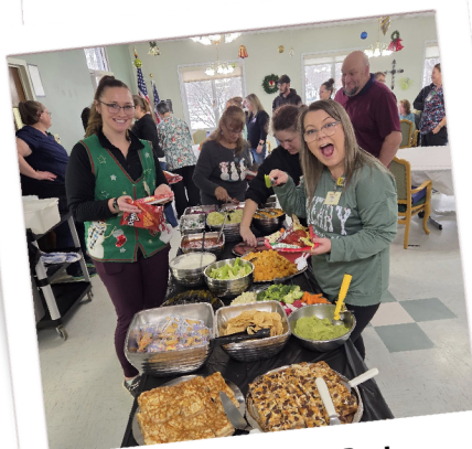
Staff Christmas Party