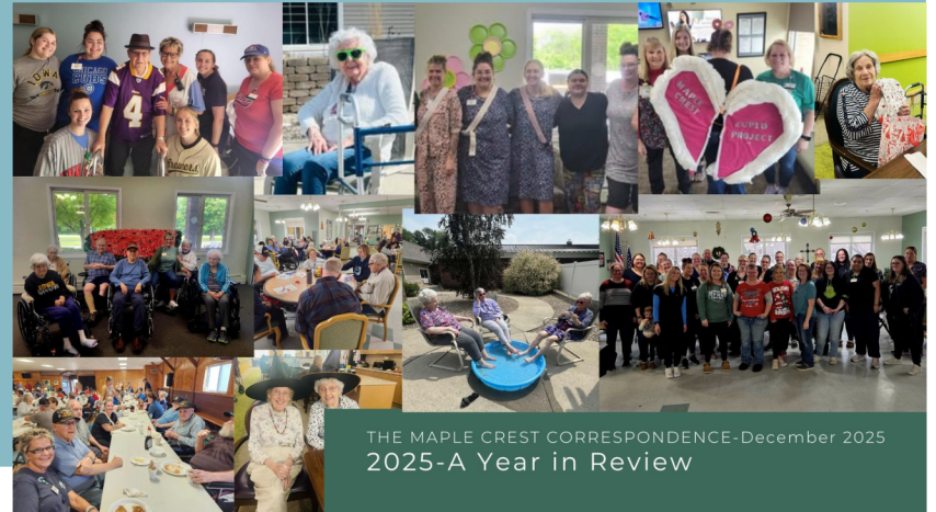
THE MAPLE CREST CORRESPONDENCE-December 2025 2025-A Year in Review

*365-The number of days we are grateful. Grateful that families have entrusted us to take care of the pillars of family. Allowed us to guide them in comfort and contentment of knowing they are cared for and close by. For getting to learn from lifetimes of lessons and memories and write our own page in these beautiful stories. The most important number of all this year.