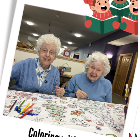
Coloring with friends